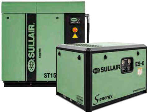
ShopTek® 5-20 hp or ES-6 S-energy®