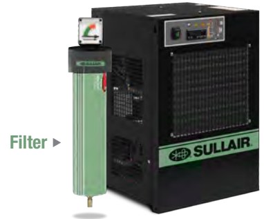
Sullair Refrigerated Compressed Air Dryer